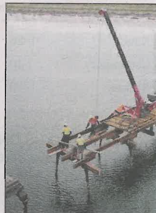
Repairs: Jetty works

nothing the council could do except to open a small portion of the jetty." The jetty has been partially opened to the community since December following storm damage. Temporary guard rails were put in place with no access beyond a certain point to ensure the safety of users. Maritime Constructions was appointed to do the work including fixing the beams and decking.