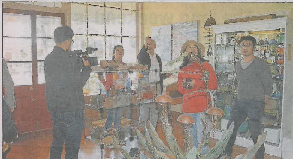
FILMING: A Chinese film group visited Robe on Saturday to film the local icons, including at the art gallery Wilson's at Robe.

The Community Diary is published every Thursday with a deadline of Monday, 12noon prior to publication. The service is free for not-for-profit organisations and while every effort is made to publish all contributions, publication cannot be guaranteed. To send in your item visit www.coastalleader.com.au , click on the community form banner and then click community diary - fill in the details needed